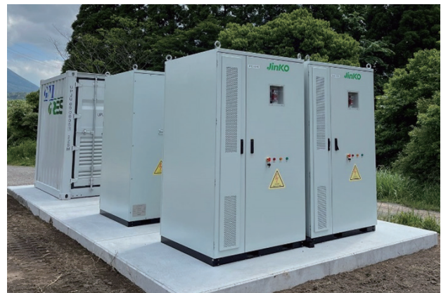
Fig. 2 Jinko ESS 215kWh DC Blocks

The DC block use lithium iron phosphate batteries, equipped with a liquid cooling system and aerosol fire protection, designed to meet the requirements of the Japanese Fire Services Law, and equipped with the Jinko ESS cloud platform.